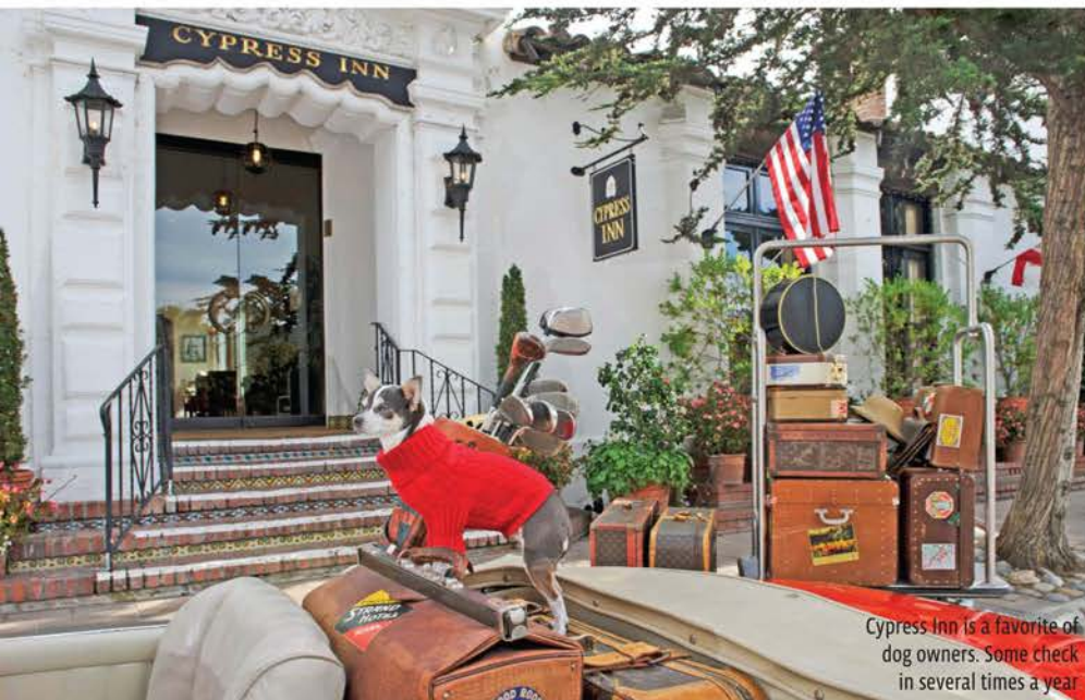
Cypress Inn is a favorite of dog owners. Some check in several times a year