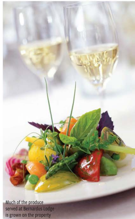
Much of the produce served at Bernardus Lodge is grown on the property

And what about those big pleading eyes that beg to join you on your travels? No problem. Man's best friend is also welcome at Bernardus Lodge. ( www.bernardus.com)