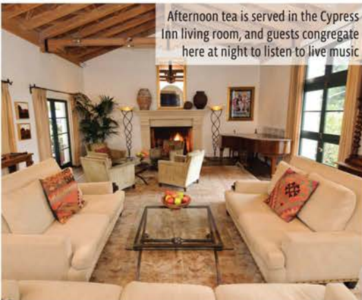
Afternoon tea is served in the Cypress Inn living room, and guests congregate here at night to listen to live music