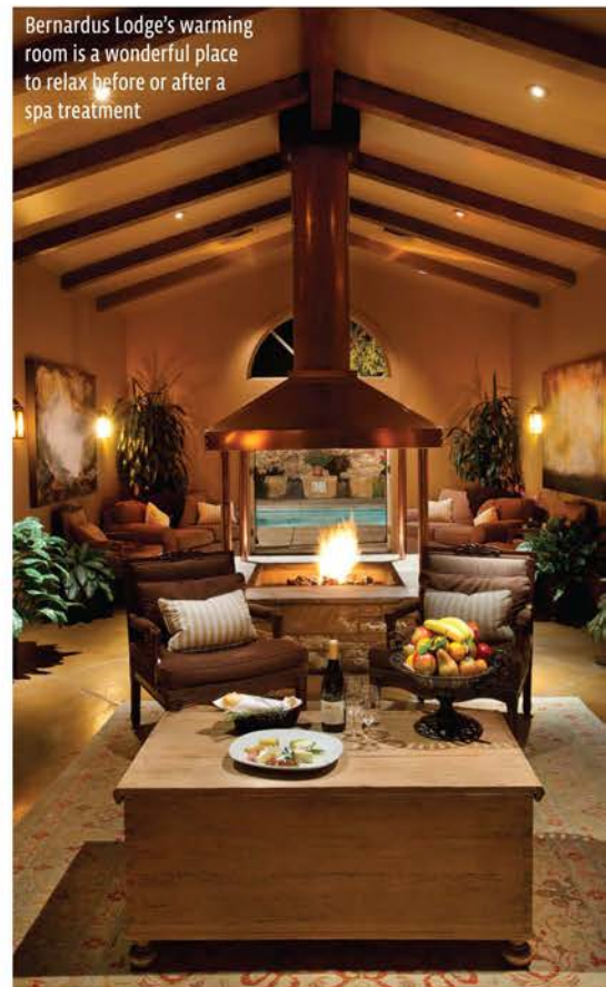
Bernardus Lodge's warming room is a wonderful place to relax before or after a spa treatment