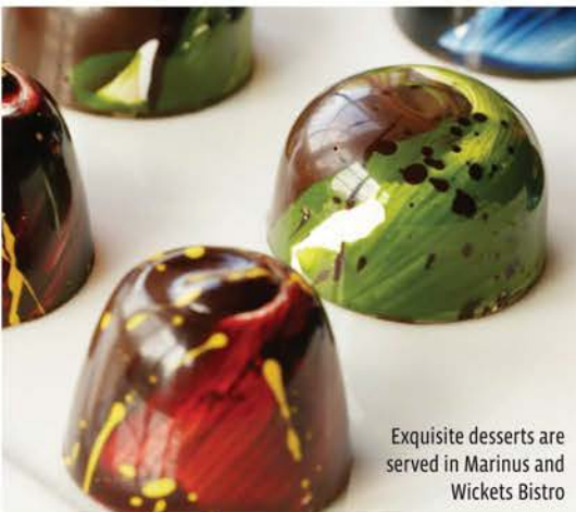
Exquisite desserts are served in Marinus and Wickets Bistro